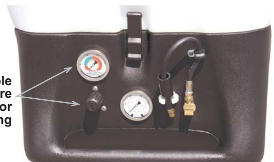
Adjustable pressure for Carpet Cleaning

181 W. Aqua Avenue Coeur d'Alene, ID 83815 Phone: (208) 772-0573 Toll Free: (800) 257-7982 Fax: (208) 772-0577 Web: www.usproducts.com